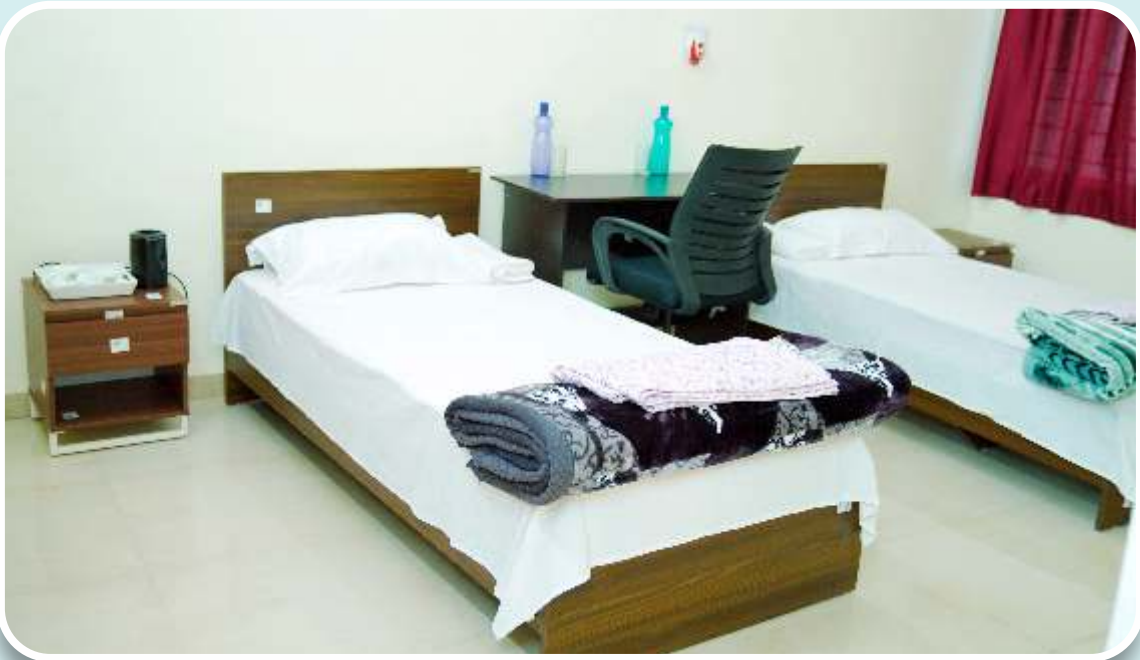
Accommodation Facility at Hostel Building, South Campus

A new 100 bedded girls hostel and the existing 100 bedded hostel make the stay of the participants comfortable during the training programmes.