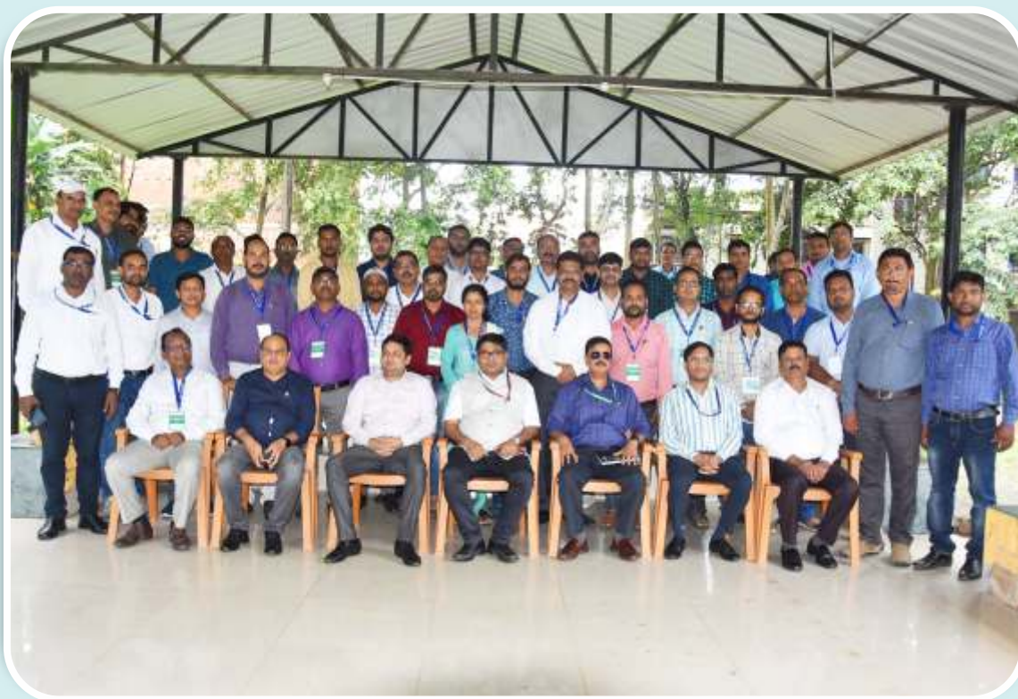
Workshop on Revised MPLADS Guidelines, 2023