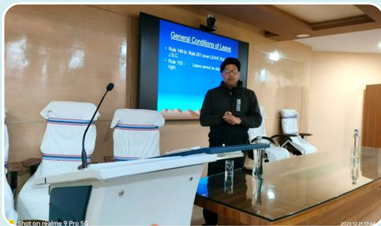
Introduction Training of MGNREGA Officials