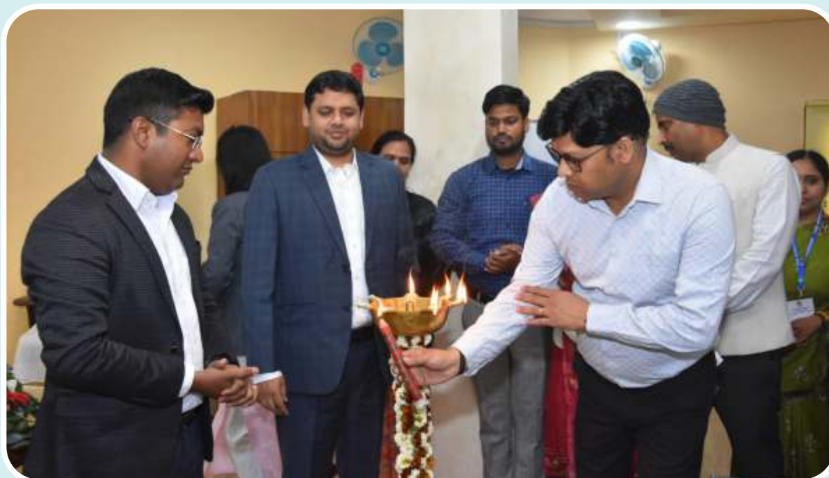
Inauguration of Revamped CRS Portal