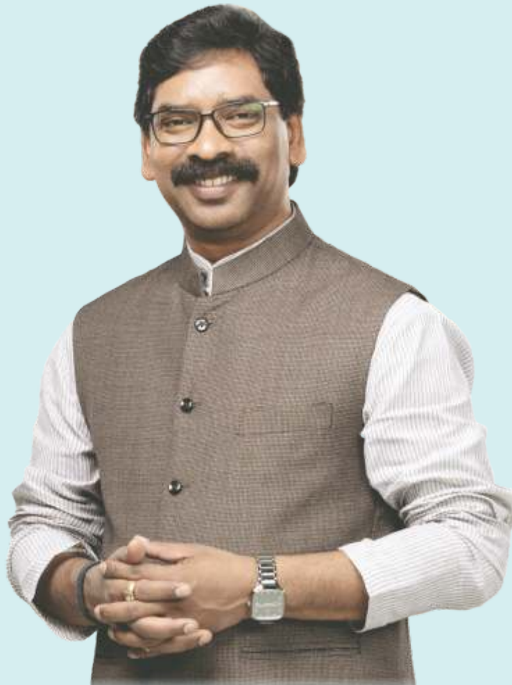
Shri Hemant Soren Hon'ble Chief Minister of Jharkhand