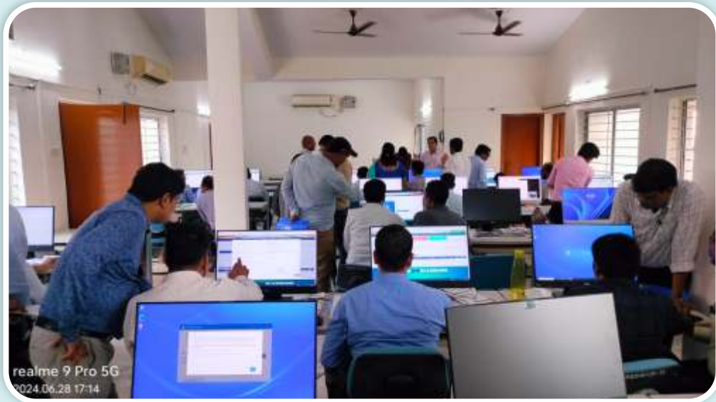
Computer Lab - 1 (Sanchar), South Campus

SIRD has two computer labs of capacity 50 & 30 respectively in the academic building with integrated Wi-fi facility for conducting various IT related training programmes.