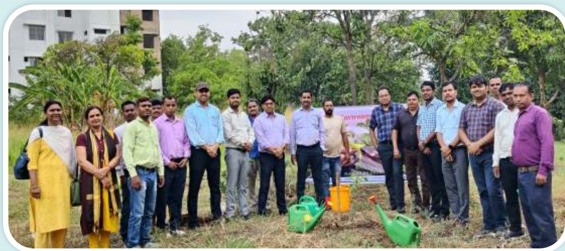
Officers & Staffs of SIRD