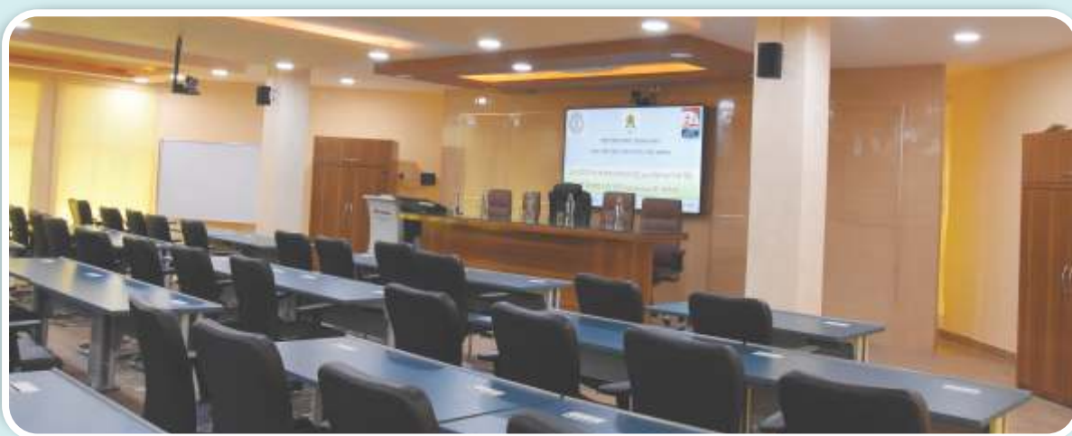
Training Hall -1, (South Campus)

SIRD, Jharkhand has two campuses, North Campus & South Campus. The North Campus commands over 18.03 acres of land which consists of the Administrative Block, Damodar Hall, Staff Quarter and a Playground. The South Campus is situated 1 km. away from the North Campus and 2 km. from Piska-more on Ratu Road. It acquires 10 acres of land and consists of the Academic & Training unit which also facilitates accommodation for The training unit comprises multiple air conditioned training halls, conference room, library and computer lab facility. The place is publicly known as Kaju Bagan. It all makes the environment a congenial place for joyful learning.