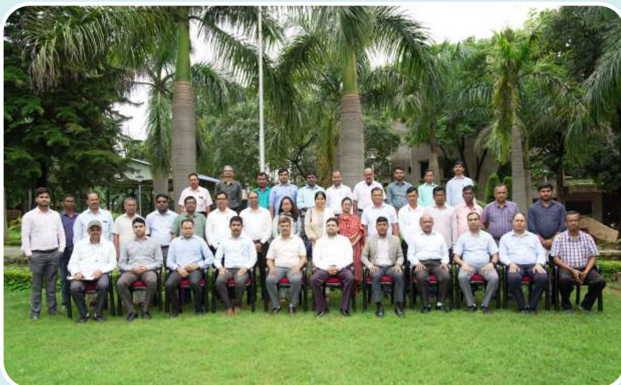
Training on NSAP & Social Security Schemes