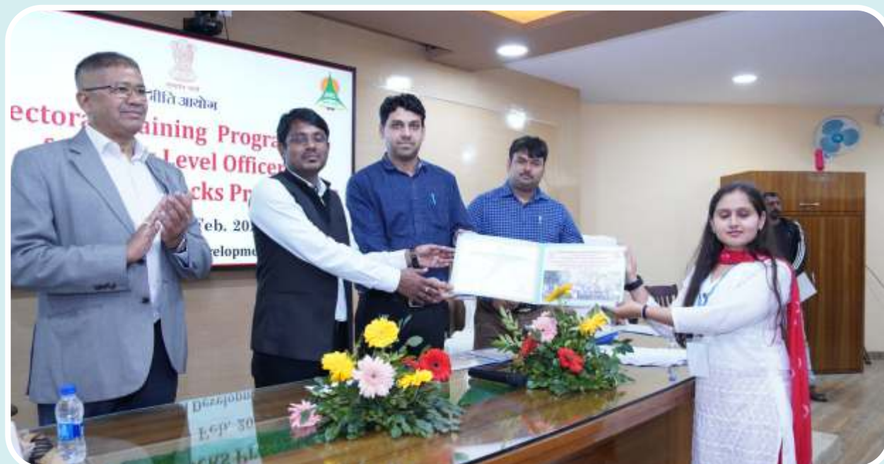
Certificate Distribution of Induction Training