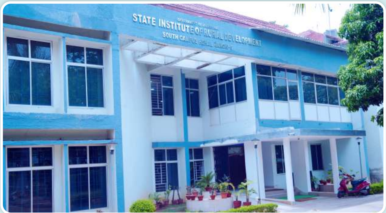
Training-cum-Hostel Premises (South Campus)