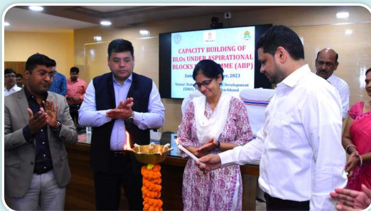
Inaugurated Ceremony at ABP Block Programme