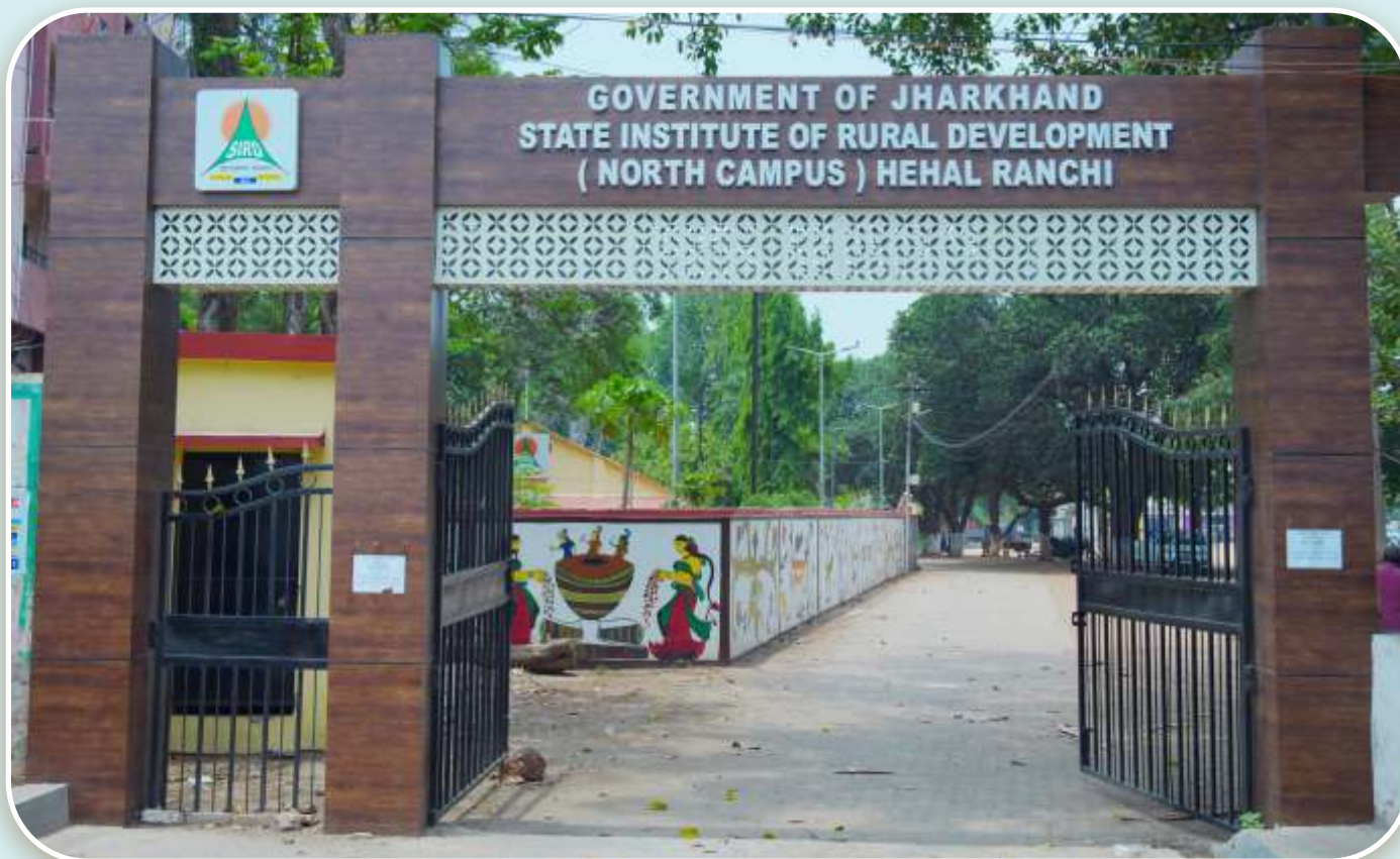
North Campus Entrance