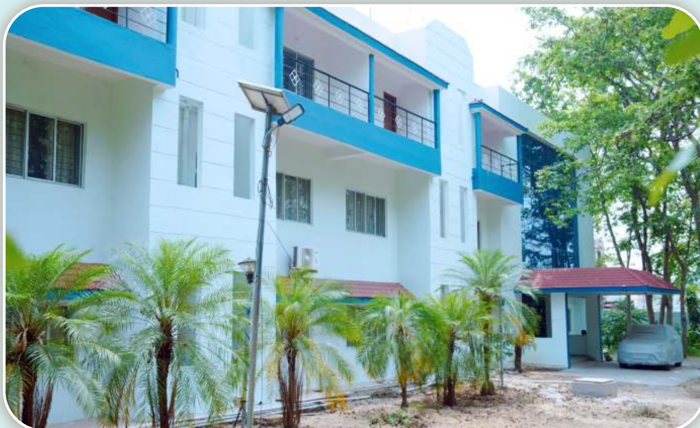
South Campus' New Hostel