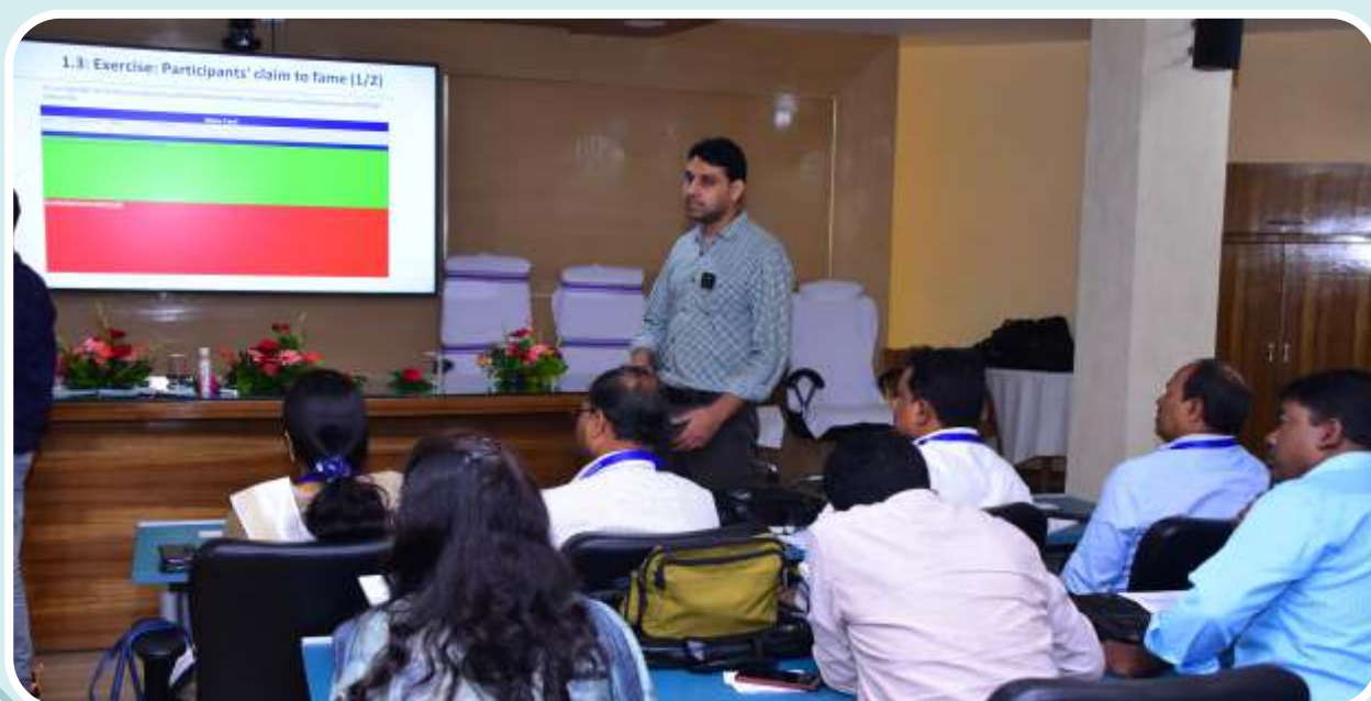
Training Programme on Social Audit