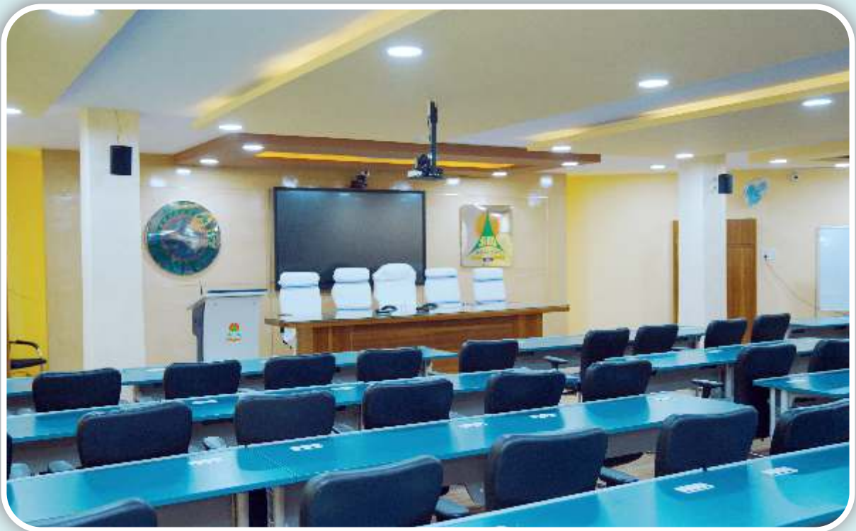
Intergrated Training Hall with Hi-tech facilities