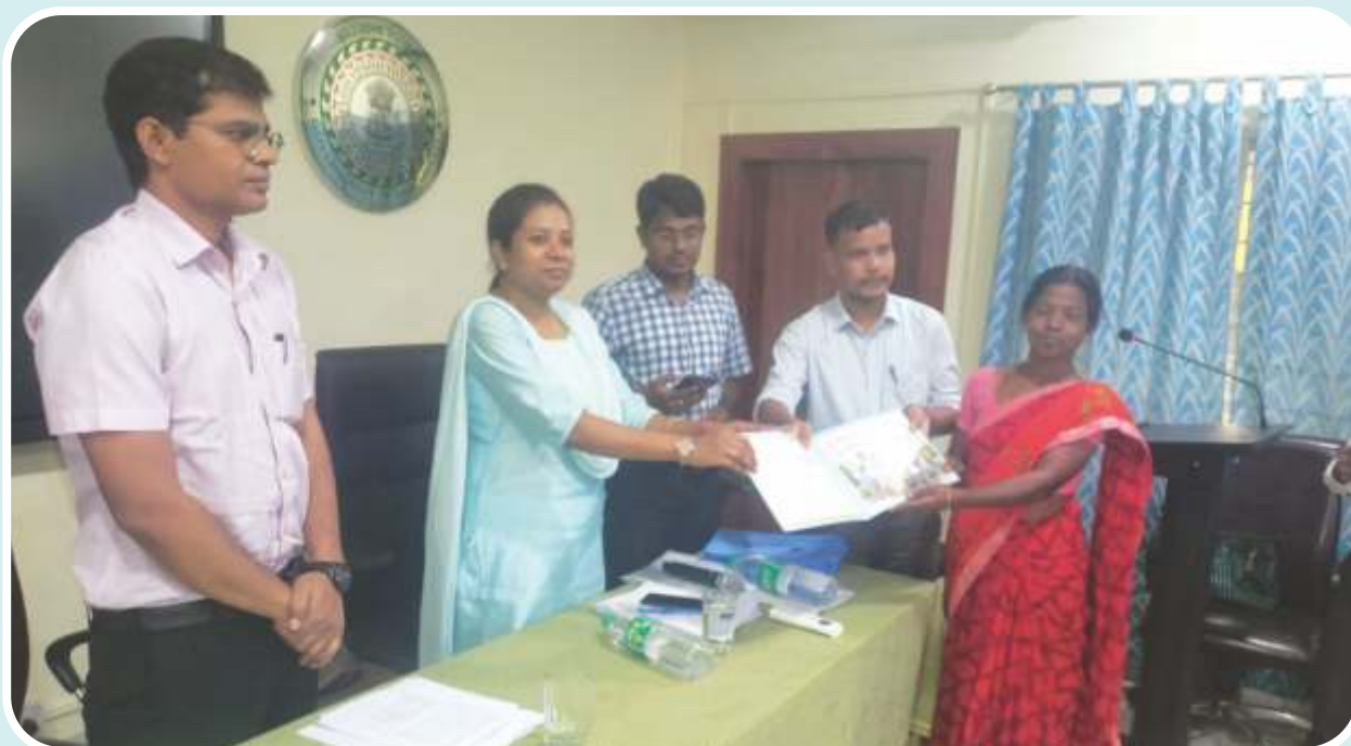
Certificate Distribution in PMAY-G/AAY Schemes