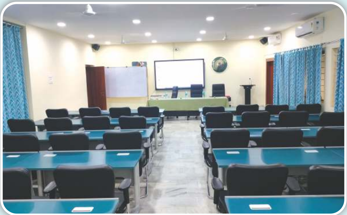
Training Hall No.-2