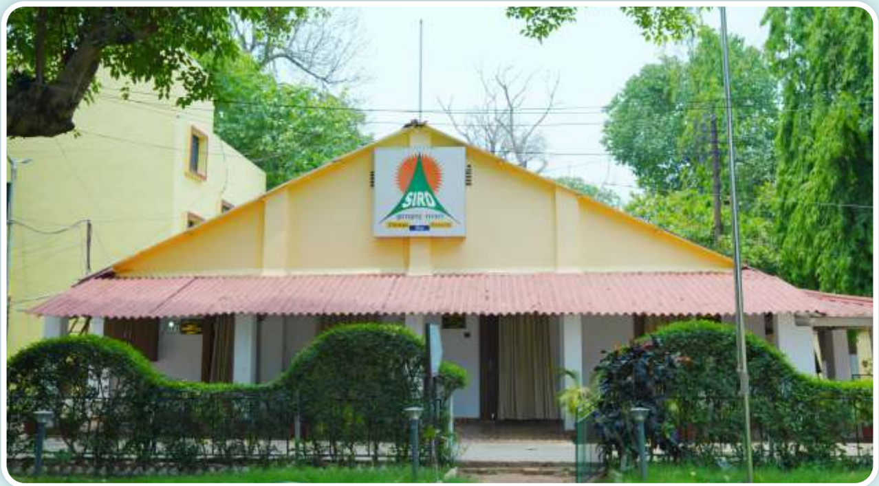
Administrative Block (North Campus)