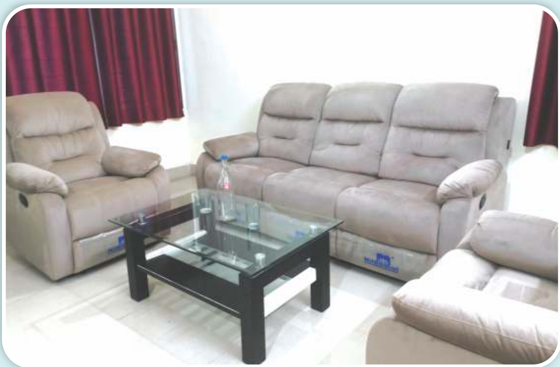
Accommodation facility at hostel building, south campus