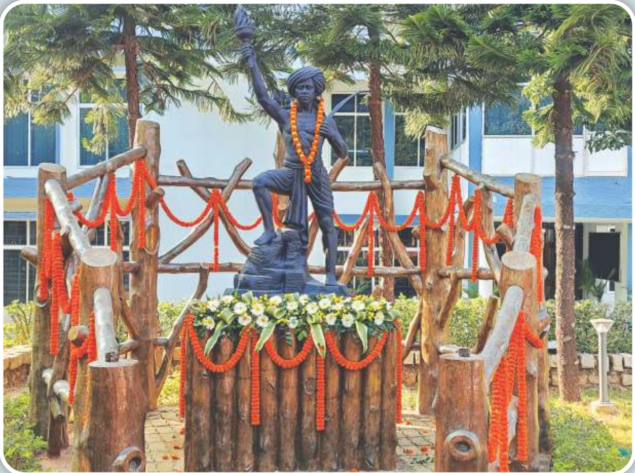
Freedom fighter Bhagwan Birsa Munda at South Campus