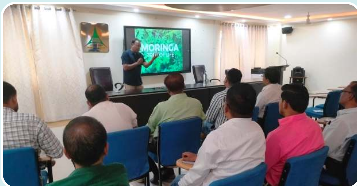
Training Session on Moringa Plantation