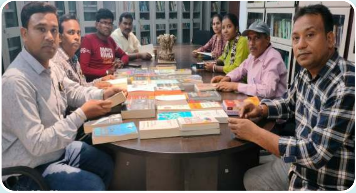
Library, South Campus