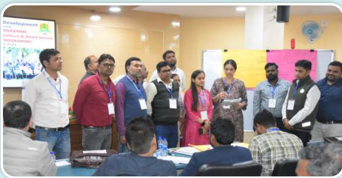
Group Discussion at ABP Workshop

In the financial year 2023-24 we emphasized on engaging the best resource persons available in the relevant fields for training programmes. Our resource persons possess the requisite skills and knowledge along with experience to design & implement effective training. One of our most important achievements during this financial year was to successfully conduct 4-5 training programmes simultaneously in the campus. In the financial year 2023-24 we successfully conducted (105) training programmes including of MoRD sponsored programmes involving total 4583 participants.