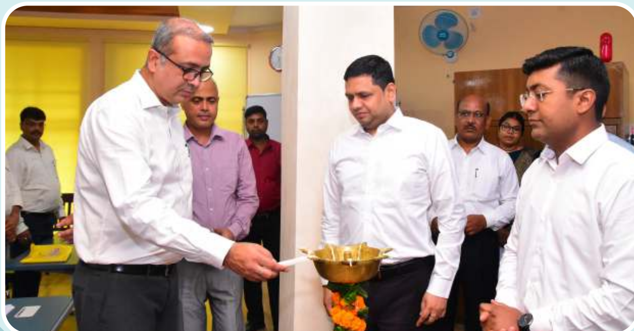
Inauguration of Rural Development & Lokapal Training