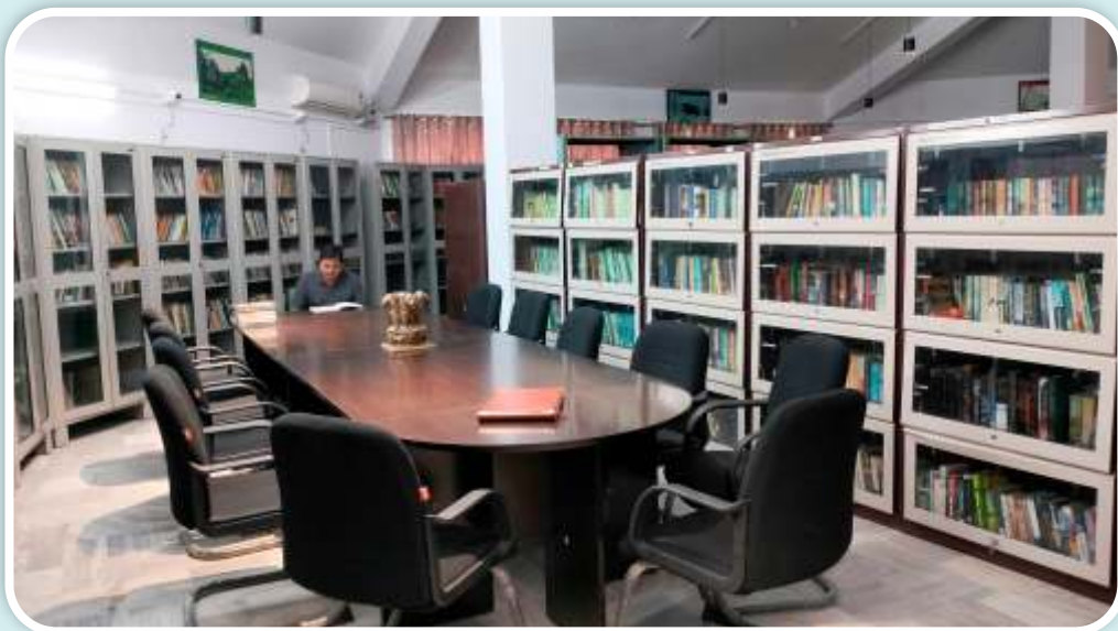
Library, South Campus

The Institute Library is digitized and well equipped having more than 24612 books, subscribed journals and periodicals.