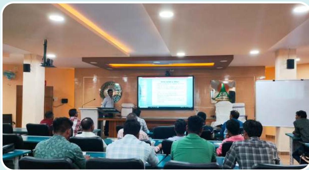
Introduction Training of Block Officials