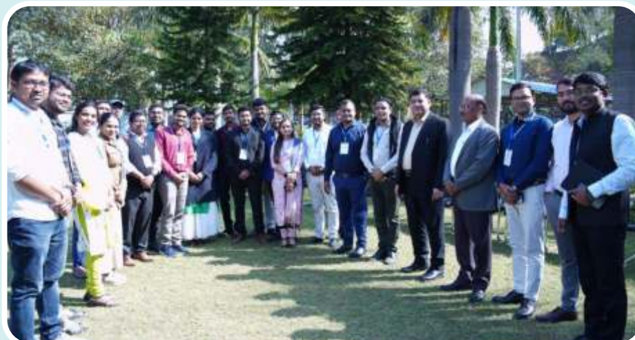
Open Session & Discussion