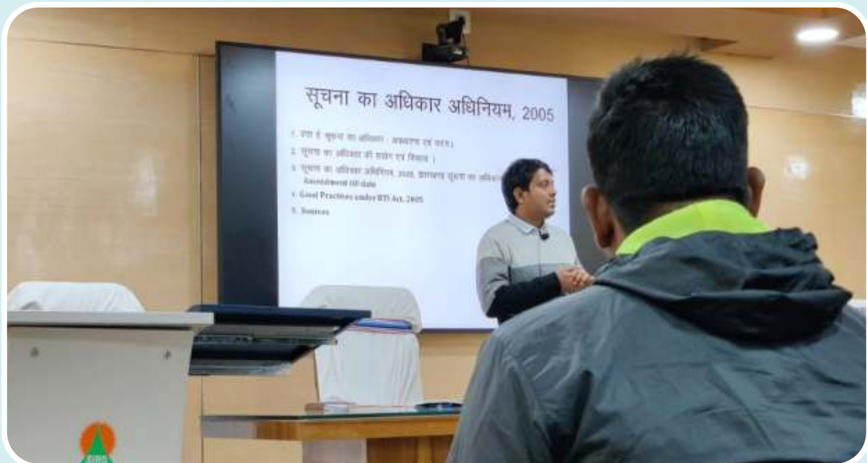
Orientation Training of District & Block Officials