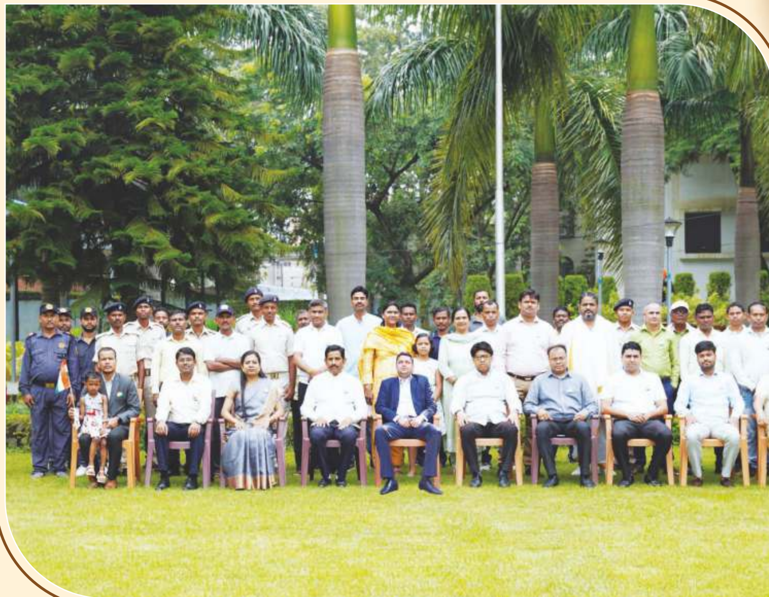
Officials and Staff of SIRD, Jharkhand