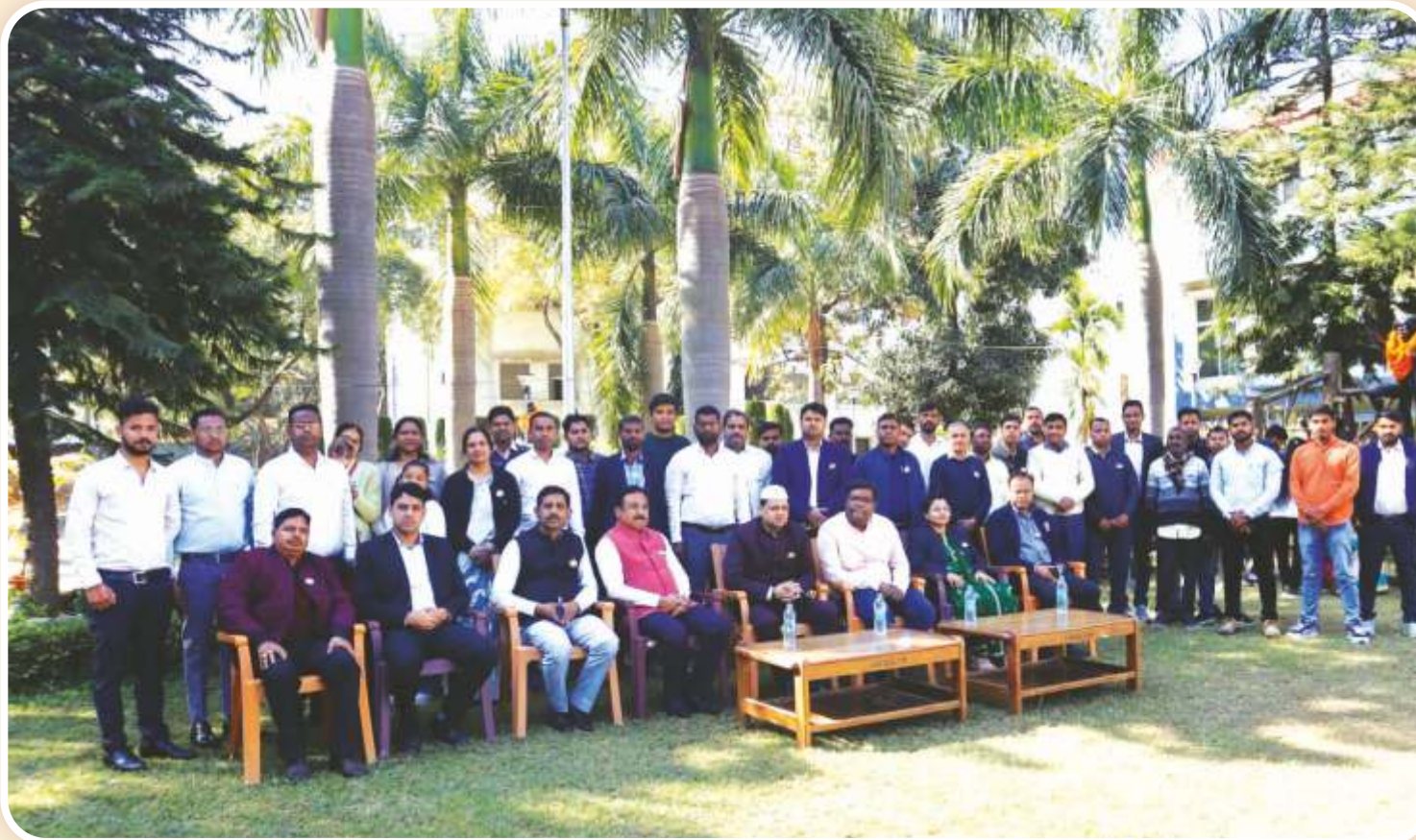
SIRD South Campus