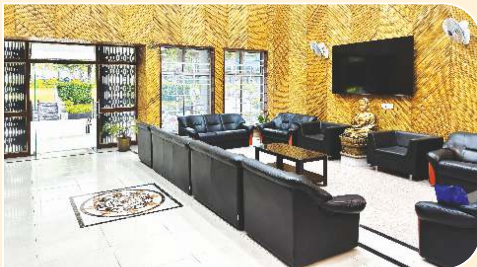
Waiting Area, South Campus