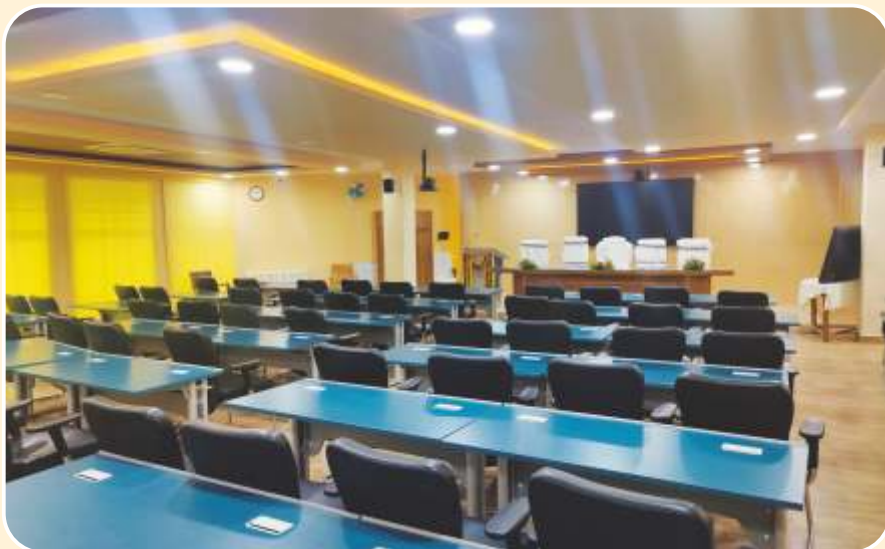
Integrated Training Hall with Hi-tech facilities