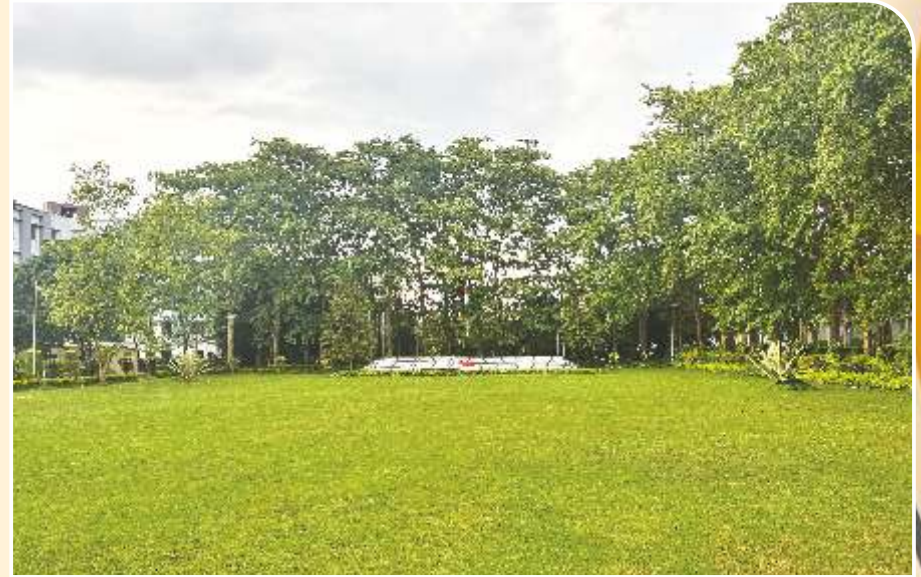
Lawn (South Campus)