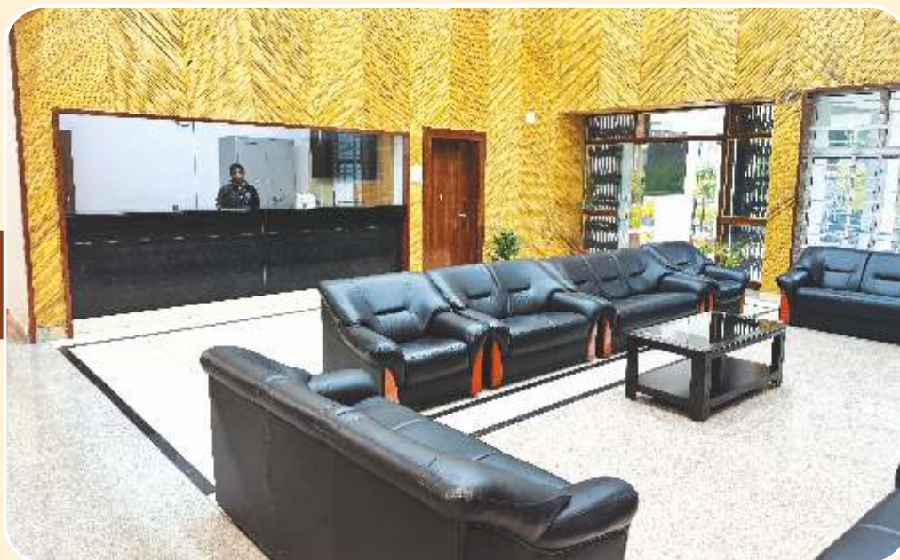
Reception (South Campus)