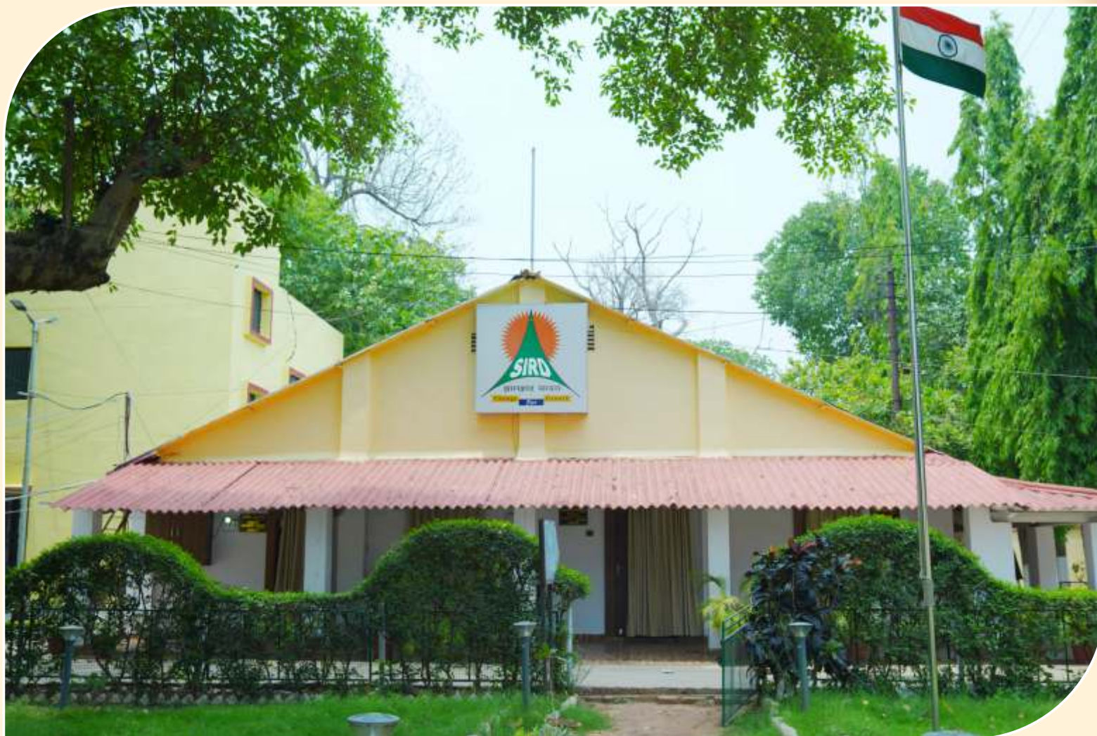
Administrative Block (North Campus)