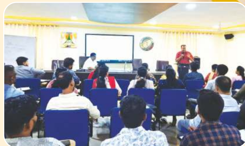
In Campus Training