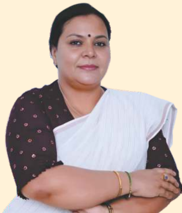
Smt. Deepika Pandey Singh Hon'ble Minister Dept. of Rural Development Govt. of Jharkhand