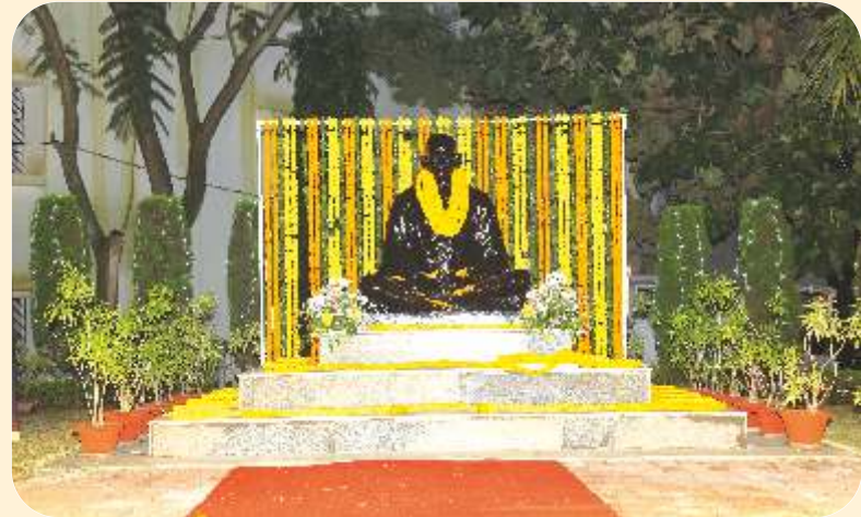
Gandhi Gram, South Campus