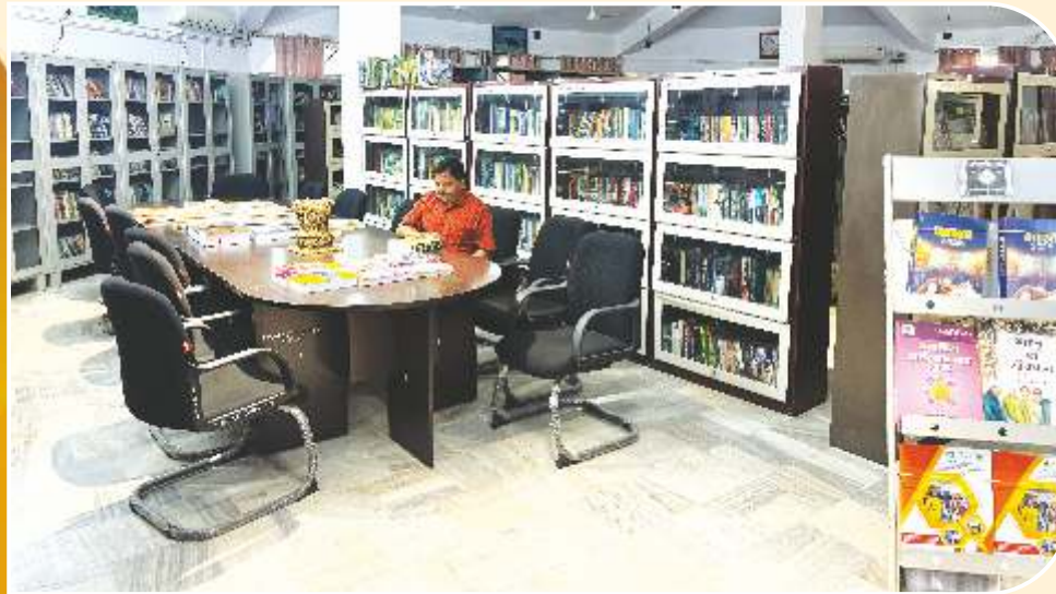
Library, South Campus