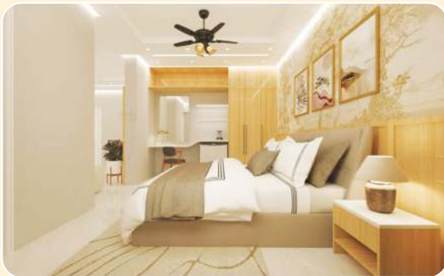
New Suit Room at hostel building, South campus