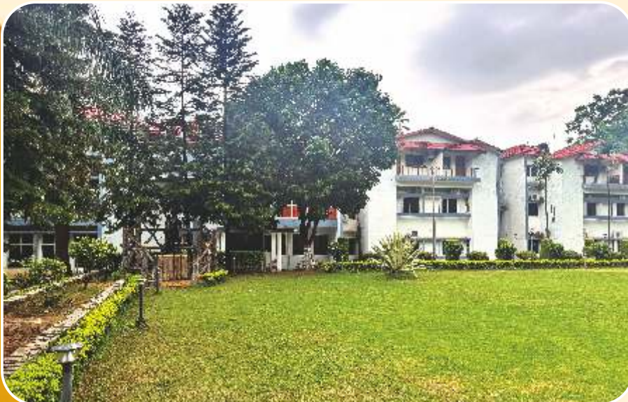
Training cum Hostel Premises (South Campus)