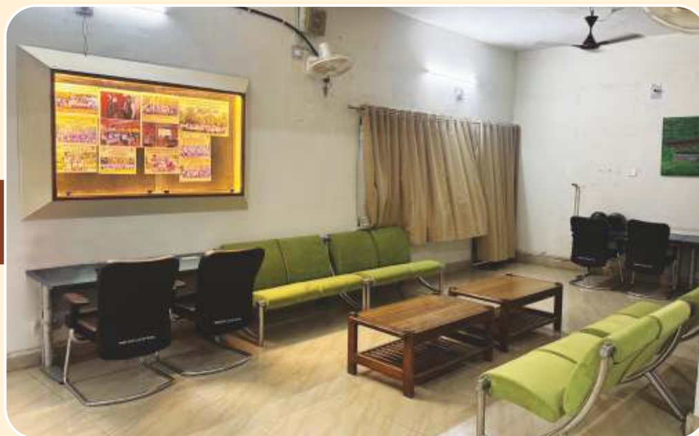
Common Room, South campus