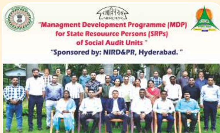
Management Development Programme (MDP)