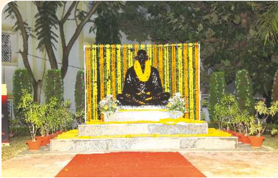
Gandhi Gram (South Campus)