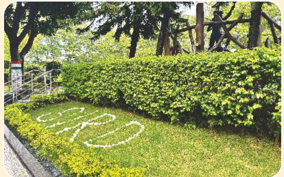
Garden Area (South Campus)