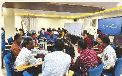
30 Days Certificate Course by NIRD&PR