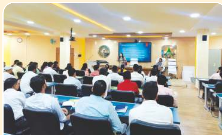
Orientation of Child Helpline Functionaries