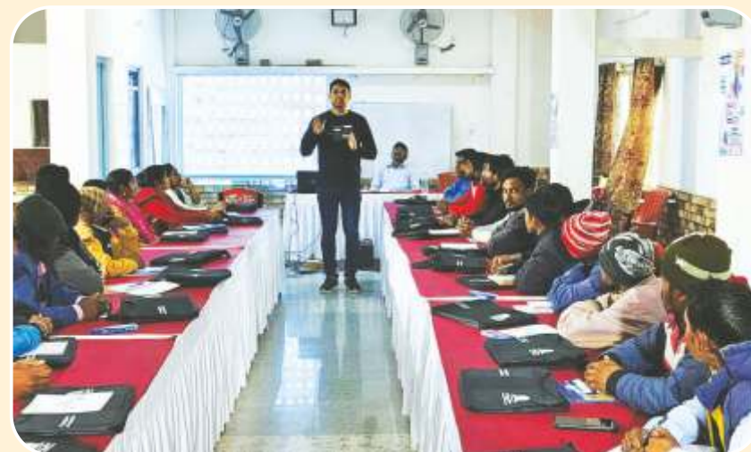
Off Campus Training