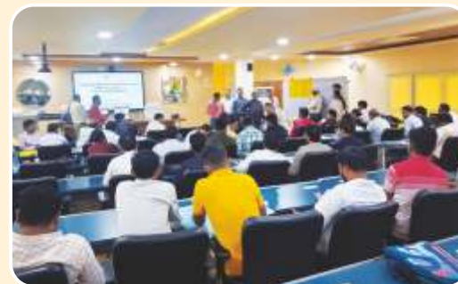
WDC - PMKSY 2.0