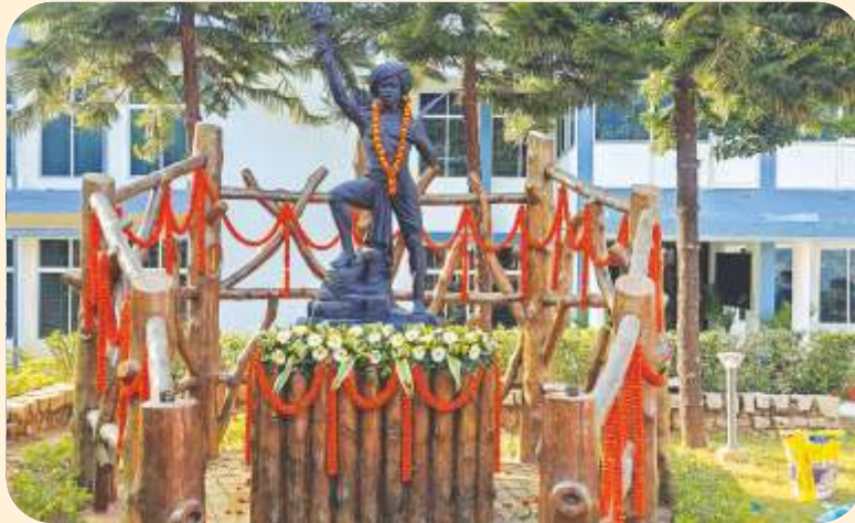
Freedom fighter Bhagwan Birsa Munda at South Campus