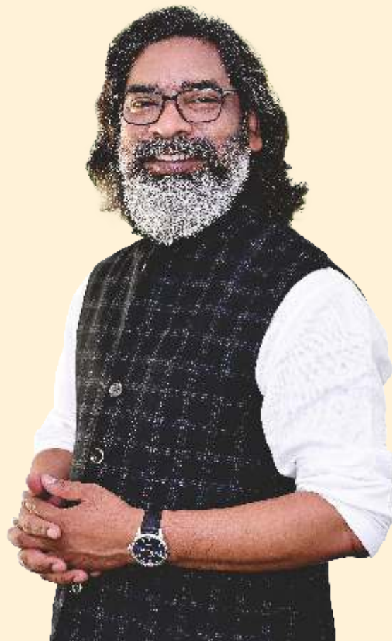
Shri Hemant Soren Hon'ble Chief Minister of Jharkhand