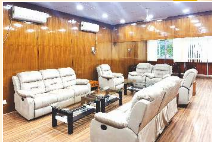
Guest Speaker Sitting Area (South Campus)

SIRD, Jharkhand has two campuses, North Campus & South Campus. The North Campus commands over 18.03 acres of land which consists of the Administrative Block, Damodar Hall, Staff Quarter and a Playground. The South Campus is situated 1 km. away from the North Campus and 2 km. from Piska-more on Ratu Road. It acquires 10 acres of land and consists of the Academic & Training unit which also facilitates accommodation for The training unit comprises multiple air conditioned training halls, conference room, library and computer lab facility. The place is publicly known as Kaju Bagan. It all makes the environment a congenial place for joyful learning.