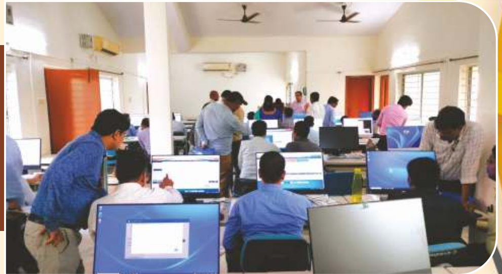
Computer Lab - 1 (Sanchar), South Campus

SIRD has two computer labs of capacity 50 & 30 respectively in the academic building with integrated Wi-fi facility for conducting various IT related training programmes.