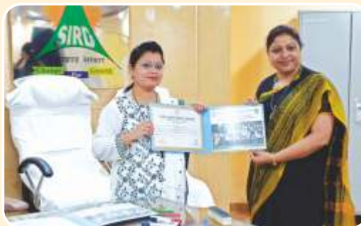
Certificate Distribution MGNREGA Lokpal